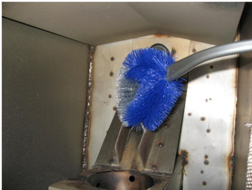
Figure 5 – Pellet Slide Cleaning